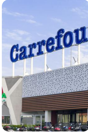
National and International HyperMarkets