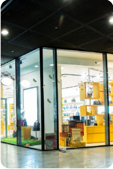
Retail Chains, Malls and Marketplaces